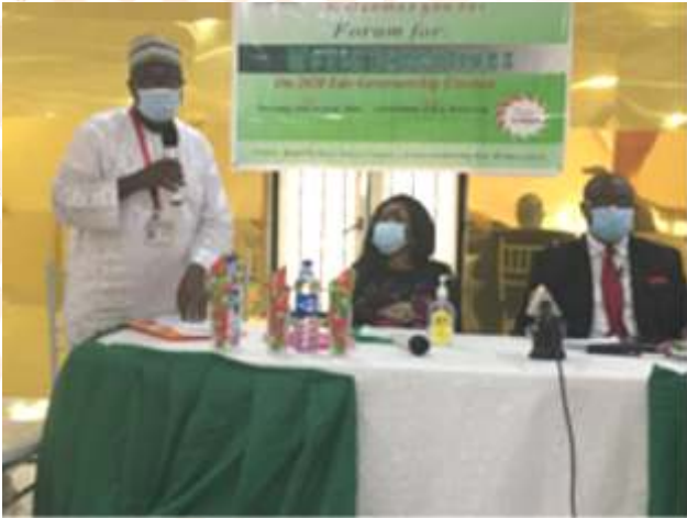
INEC Forum for media executives in Edo State on the Conduct of Governorship election.