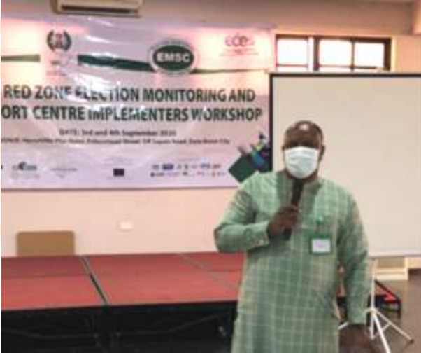
The 2-Day Election Monitoring and Support Centre Implementers' Workshop, which begins today in Benin city. #EdoDecides2020