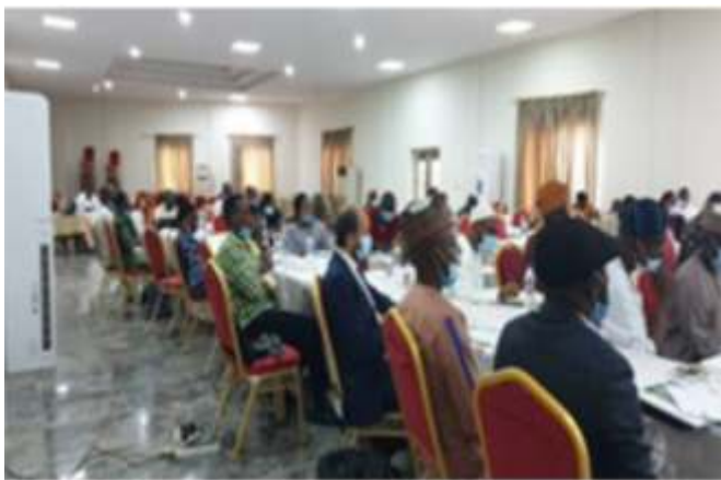
Ondo State Election Monitoring & Support Centre Red Zone Implementers' Workshop.