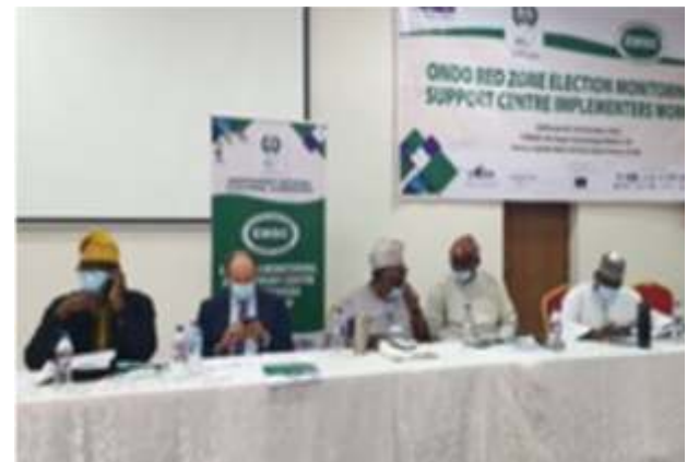
The Election Monitoring and Support Centre Red Zone Implementers' Workshop in Akure, Ondo State.