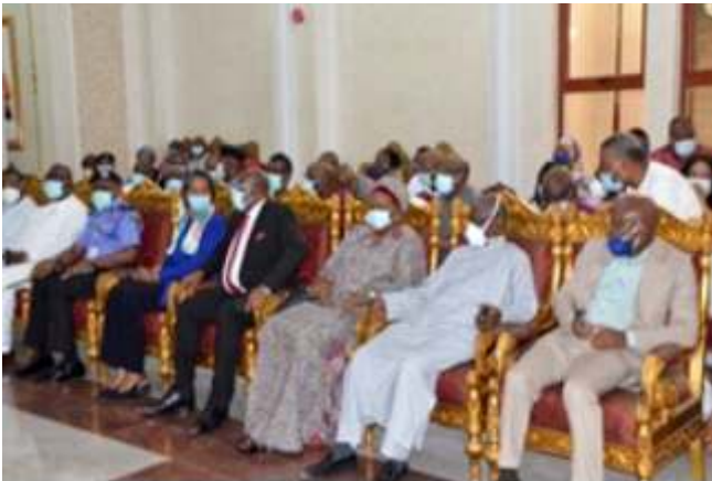
Hon. Chairman INEC, Prof. Mahmood Yakubu and Members of the Commission on a courtesy visit to the Oba of Benin, Oba Ewuare II ahead of the #EdoDecides2020 Governorship election.