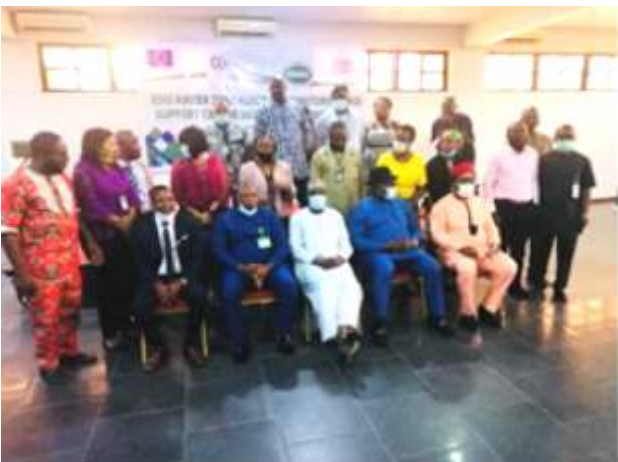
Election Monitoring and Support Centre Implementers' Workshop from 17th to 18th Aug in Benin City.