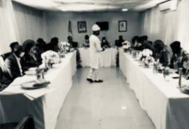
Inter-Agency Consultative Committee on Election Security (ICCES) Meeting on preparation for #EdoDecides2020 at the INEC State Head Office, Edo State.