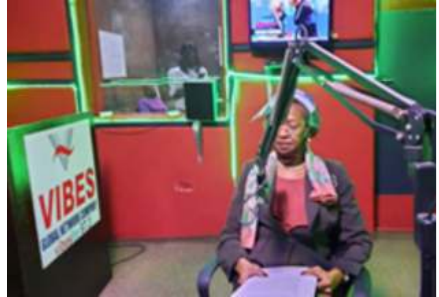
INEC National Commissioner and Supervising Commissioner of Edo, Bayelsa and Rivers States, Mrs. May Agbamuche-Mbu in a Radio Programme on Vibes FM 97.3, discussing INEC preparation on Conducting of election under the context of Covid-19 Pandemic.