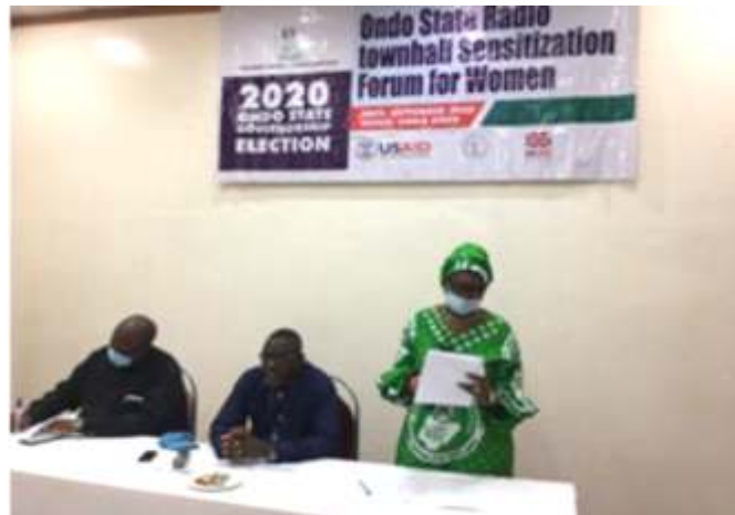
Live Radio Town Hall Meeting with Women Groups on Women's Participation in the Electoral Process. #OndoDecides2020.