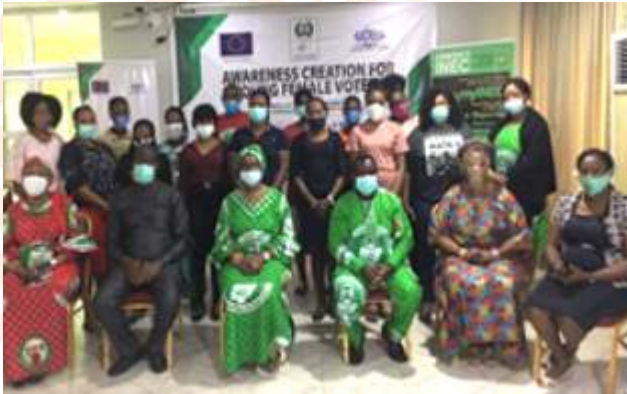
Group Photograph of participants @ the Awareness Creation Forum For Young Female Voter Towards 2020 Governorship Election event in #OndoDecides2020