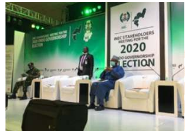
Hon. Chairman INEC, Prof. Mahmood Yakubu, Members of the Commission, Technical Aides of the Hon. Chairman and Directors of the Commission @ the #OndoDecides2020 Stakeholders Meeting in Akure.