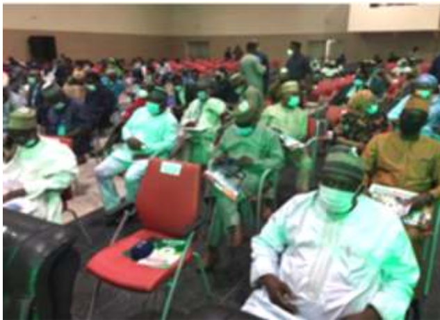
Stakeholders Meeting ahead of the #OndoDecides2020 Governorship Election