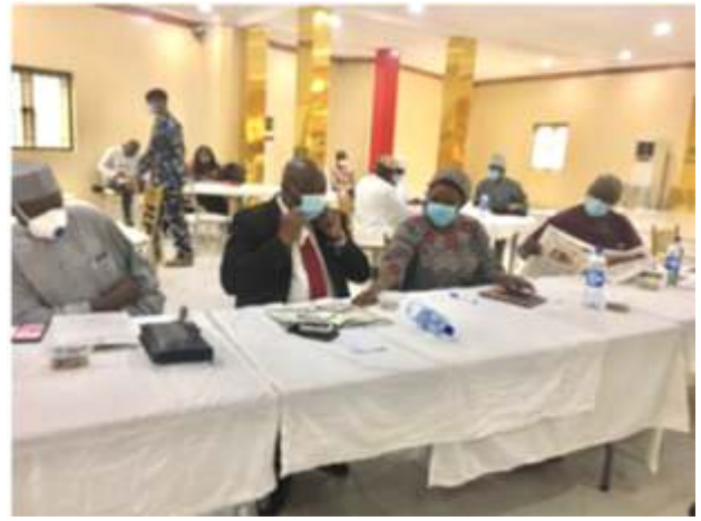
Meeting of the Hon. Chairman INEC, Prof. Mahmood Yakubu with the Inter-Agency Consultative Committee on Election Security (ICCCEs) at Benin Edo State. #EdoDecides2020.