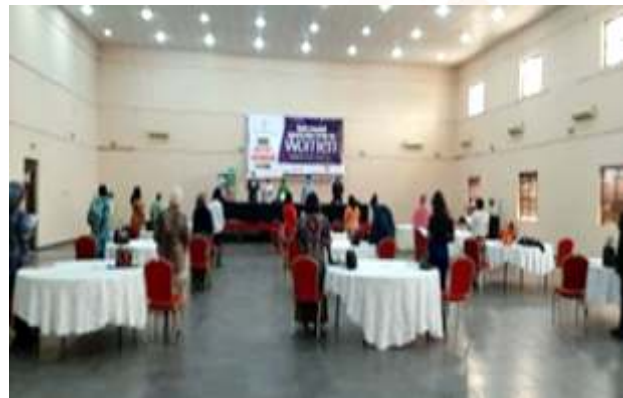
Live Radio Town Hall Meeting with Women Group on Women's Participation in the Electoral Process in Benin, Edo State ahead of the #EdoDecides2020 election