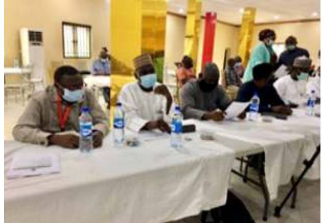
Chairman INEC, Prof. Mahmood Yakubu, Members of the Commission, his technical team and Directors of the commission in a meeting with Electoral Officers in Benin, Edo State. #EdoDecides2020