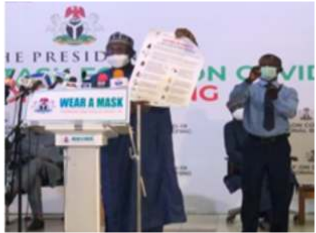
INEC Chairman, Prof. Mahmood Yakubu displays the 10-Point Voters' Code of Conduct poster and hand bill; Braille version of the INEC Policy in Conducting Elections in the Context of the COVID-19 pandemic and the Code of Conduct/Rules of Engagement for Security.