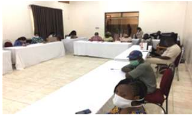
Voter Education Sensitization Forum for Persons with Disabilities and PWD Focal CSOs