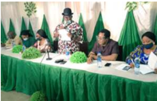
Implementation Meeting with NOA, NYSC and INEC Electoral Officers on Voter Enlightenment and Publicity for #EdoDecides2020 Election in Benin, Edo State.