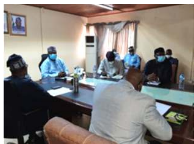
Chairman, Prof Mahmood Yakubu, some National Commissioners, the Technical Team and some Directors are at the Commission's office in Akure Ondo State for a series of activities leading to Ondo State Governorship Election slated for 10th October 2020.