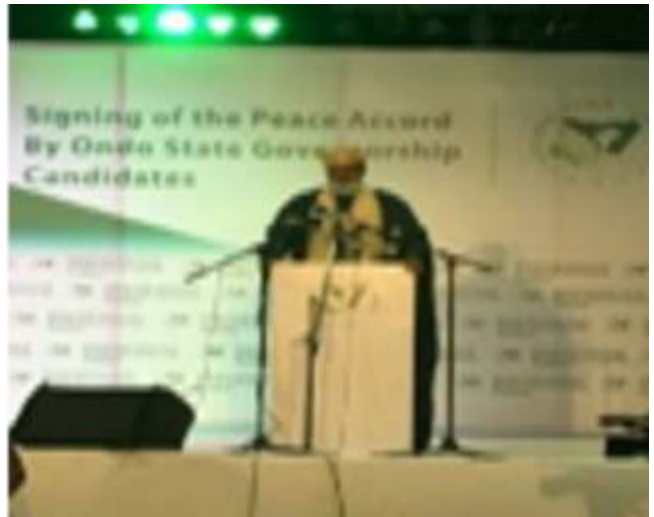
The singing of Peace Accord by #OndoDecides2020 Governorship Candidates