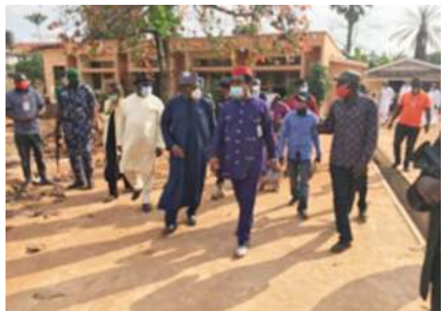
Hon. Chairman INEC, Prof. Mahmood Yakubu & Members of the Commission pays a visit to the INEC State Head office in Benin; to assess the preparedness of the Commission ahead of #EdoDecides2020 Governorship Election.