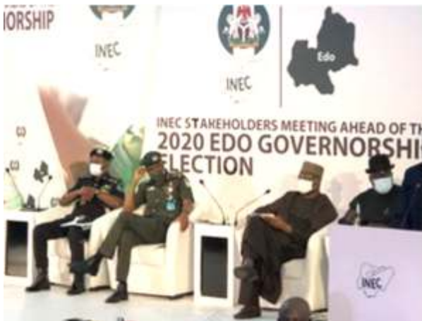
The 2020 Edo State Governorship Election Stakeholders' Meeting begins in Benin City. #EdoDecides2020.