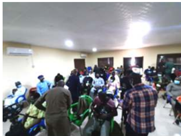
INEC Chairman, Prof Mahmood Yakubu and team of National Commissioners, Technical team and some directors are meeting with the Media in Akure Ondo State.