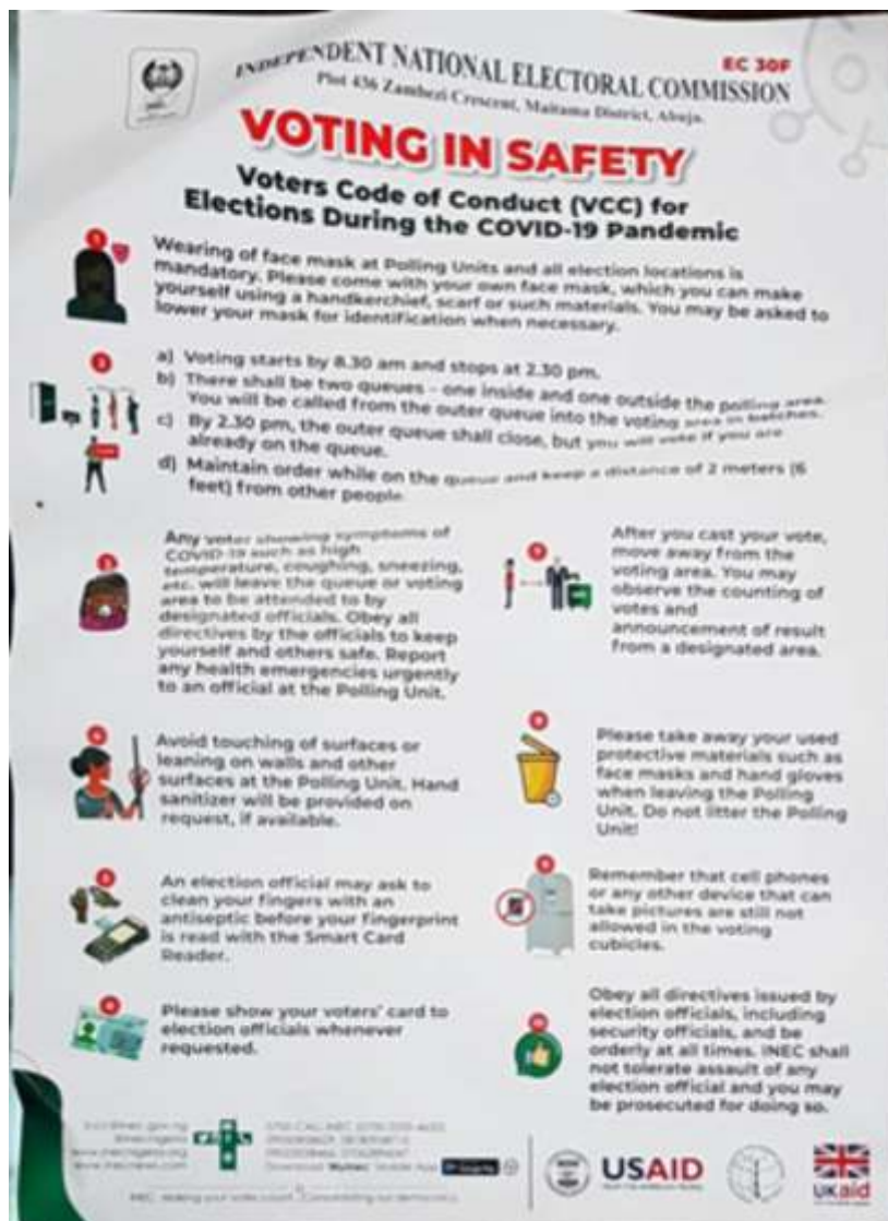
Voters Code of Conduct

However, it is regrettable that the general VCC posters are not easily available online. To increase reach, the general VCC should have been uploaded on all of INEC's platforms and publicised effectively, particularly for the Edo election, as no specific VCC was created for that state.