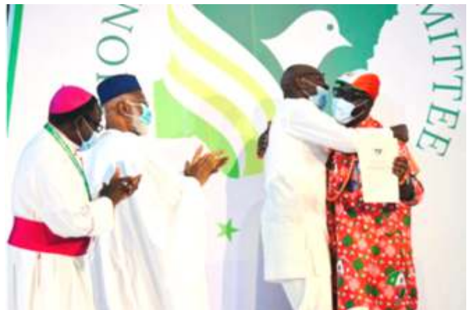
Peace Accord Signing Ceremony #edodecides#.