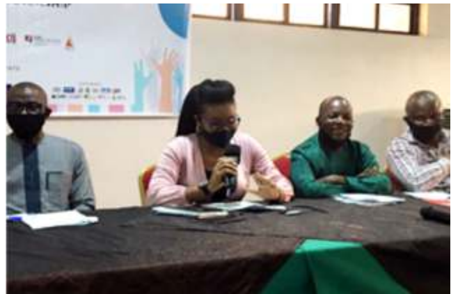
Panel discussion on Youth and peaceful participation in electoral process at the Live Citizens Radio Town Hall on Youth and Non-Violent Participation in the 2020 Edo Governorship Election. #EdoDecides2020