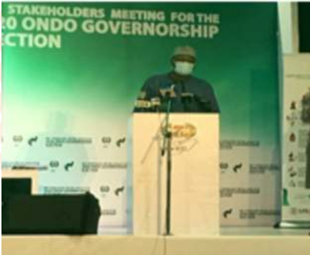
Remarks by the Chairman of the Commission, Prof. Mahmood Yakubu, at the ongoing Stakeholders Meeting ahead of the #OndoDecides2020 Governorship Election.