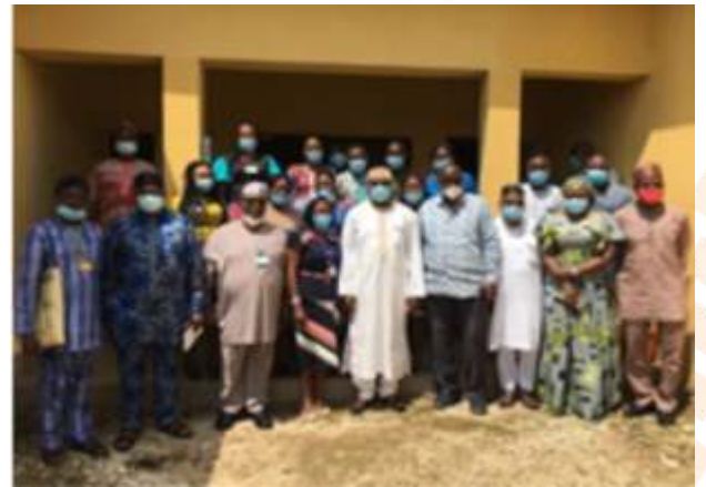
INEC Chairman, National Commissioners, REC Ondo State, HODs, Electoral Officer Ifedore LGA and other Staff.