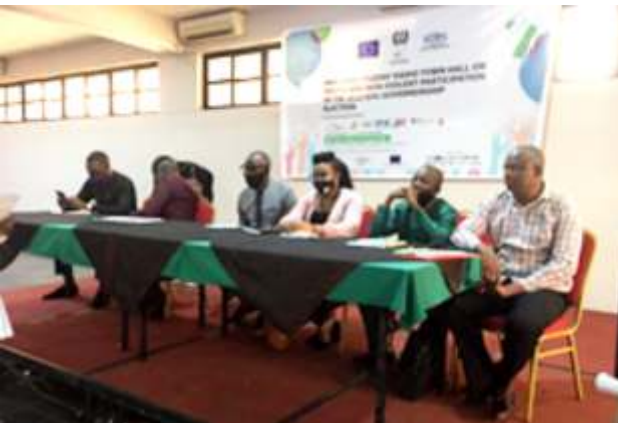
INEC Live Citizens Radio Town Hall on Youth and Non-Violent Participation in the 2020 Edo Governorship Election. Kindly tune to Raypower 105.5 Benin City Edo State to be part of the program. #EdoDecides2020