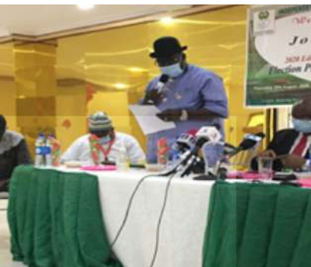
INEC workshop for Journalists in Edo State On Election Processes and Procedures #EdoDecides2020.