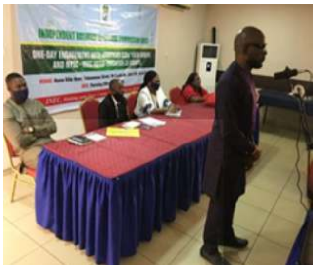
One-Day Engagement with Identified CSOs, Youth Groups and NYSC (Voter Education Community Development CD Group) ahead of the #EdoDecides2020 election.