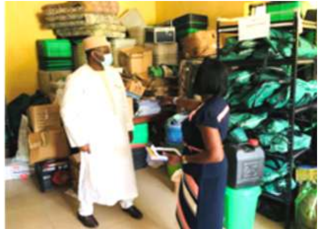
Ondo2020: INEC Chairman Pays Readiness Assessment Visit to Ifedore LGA.