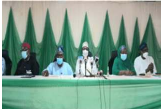
Hon. Chairman INEC, Prof. Mahmood Yakubu, some National Commissioners, the Technical team and some Directors of the commission in a meeting with Electoral Officers in Akure, Ondo State. #OndoDecides2020