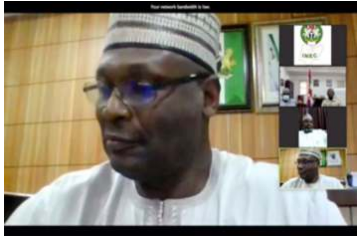
Virtual Meeting: INEC and Political Parties Engagement