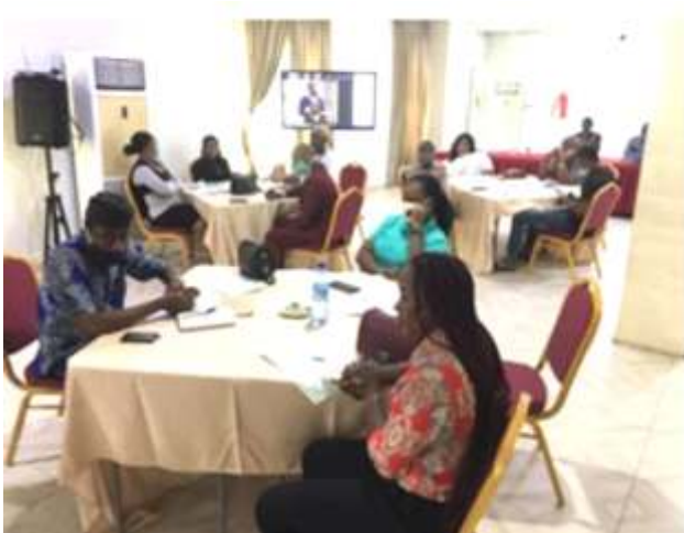
One-Day Virtual Engagement with Identified CSO/Youth Groups and NYSC ahead of the #OndoDecides2020 in Ondo State.